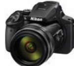
Nikon Coolpix P900 HK$5,480