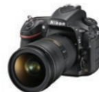
Nikon D810 (Body) HK$26,800