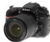
Nikon D7200 (18 - 140mm Kit Set) HK$11,980