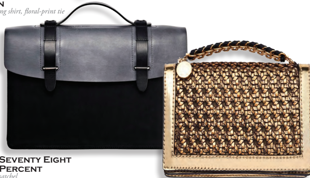
SEVENTY EIGHT PERCENT satchel