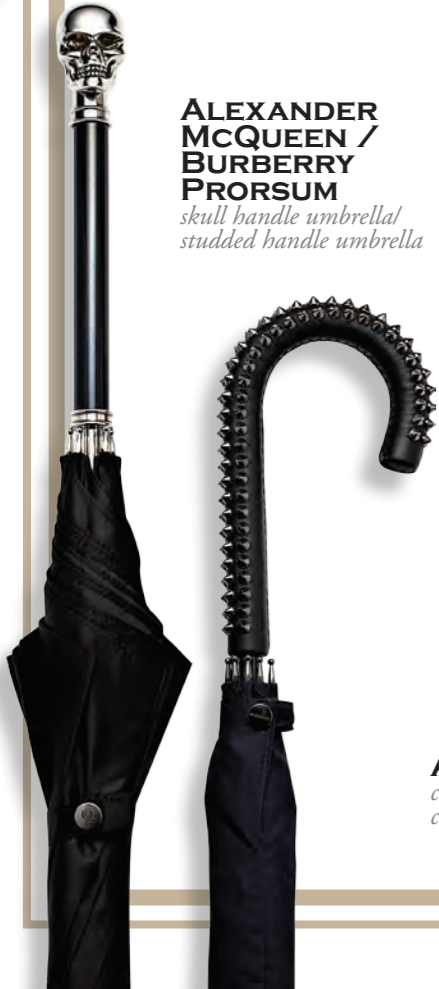
ALEXANDER MCQUEEN / BURBERRY PRORSUM skull handle umbrella / studded handle umbrella