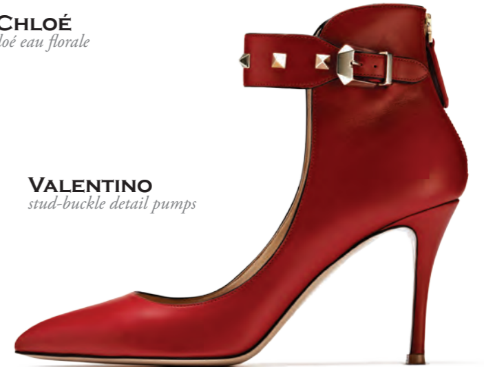
VALENTINO stud-buckle detail pumps