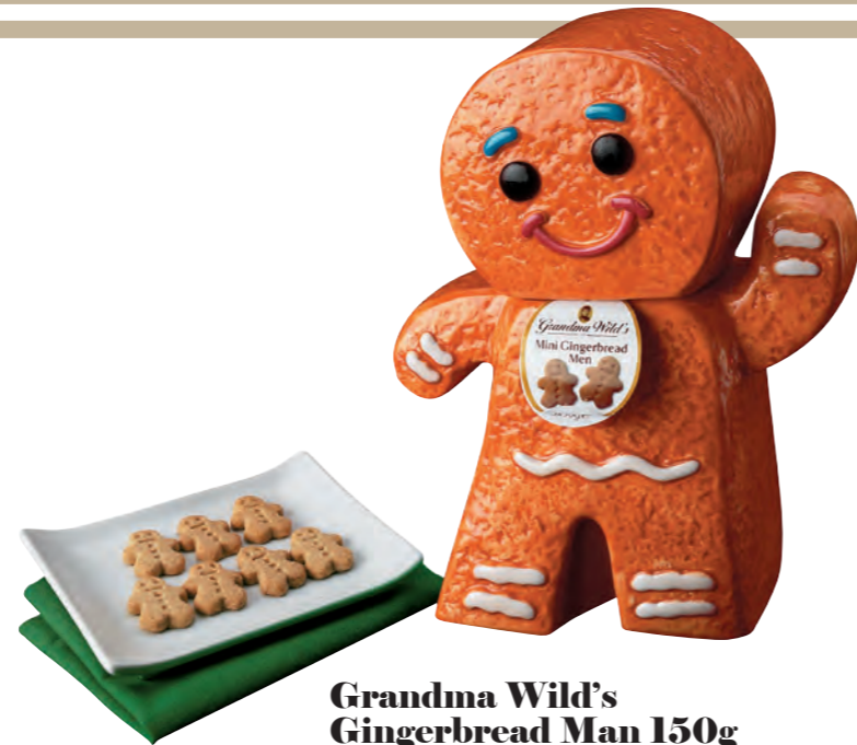
Grandma Wild's Gingerbread Man 150g HK$220