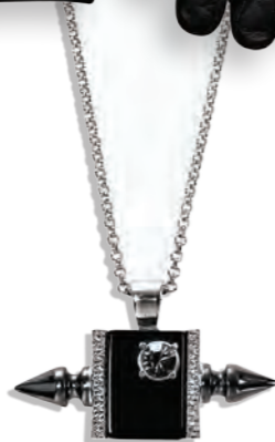
SIR BY MAWI spiked onyx signet pendant