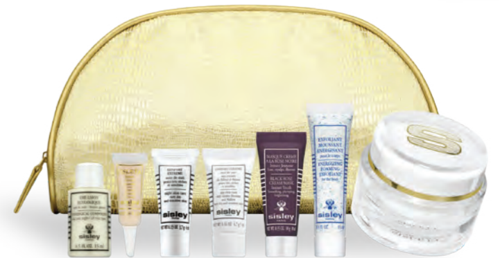
SISLEY festive sisleja global anti-age set