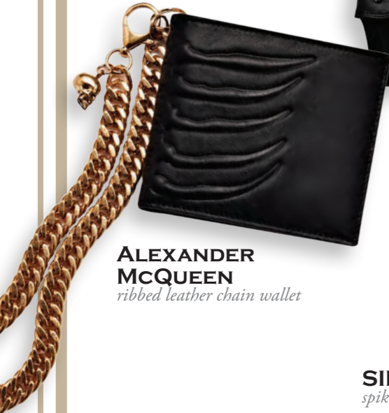
ALEXANDER MCQUEEN ribbed leather chain wallet