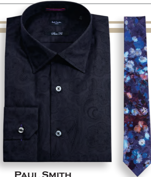
PAUL SMITH LONDON paisley evening shirt, floral-print tie