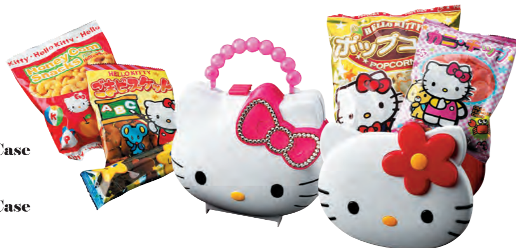
Heart Hello Kitty Face Case Container with Snacks HK$210