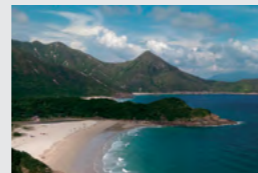
— MOST STUNNING SCENERY SHOT — Lau Chi Chiu