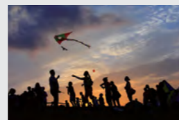
— FIRST RUNNER-UP — Leung Kam Wing