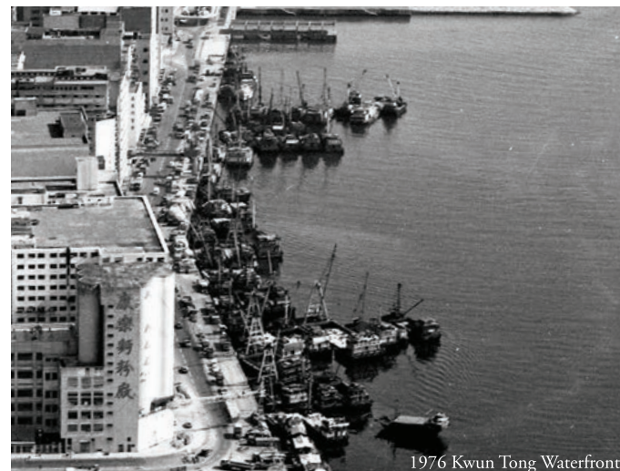
1976 Kwun Tong Waterfront

Wheelock Properties has invited photographers to chronicle the magnificent change in the "City Transformation Photo Competition". The winning works showcase here alongside old photo collections that document Kowloon East's renewal and artworks created by The Wharf Young Art Ambassadors.