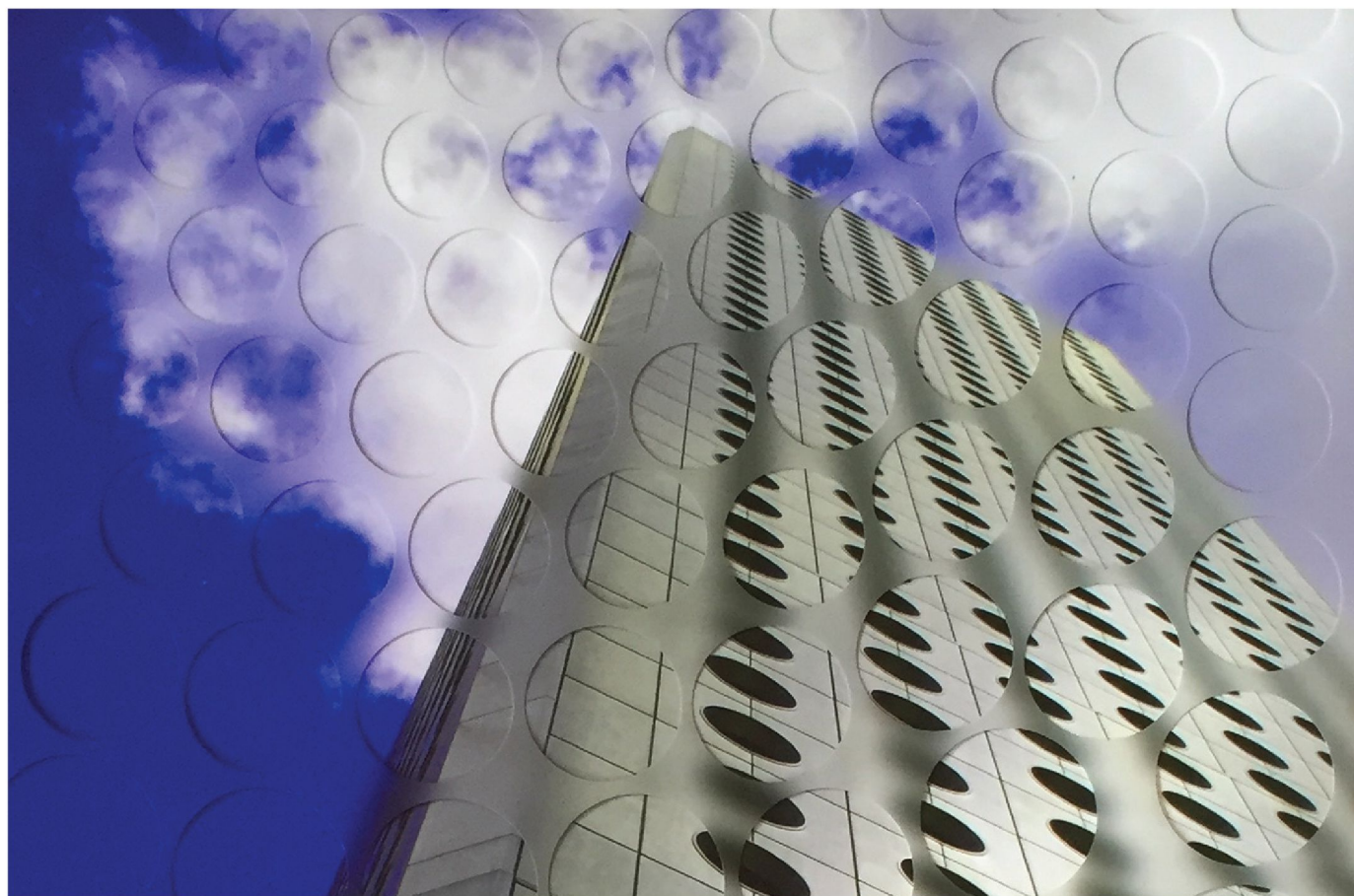
"Ultramarine Sky" by Eleanor McColl, @MCCOLL & SMITH, Hong Kong, Room 4118

See over 2,000 artworks from Asia and the world at the 14th Asia Contemporary Art Show ( www.asiacontemporaryart.com ). Browse and buy original paintings, limited editions, sculpture and photography from some of the world's most interesting and promising artists – from emerging and mid-career artists, to those who have already achieved recognition in private and public collections, and at auction. Visit the exciting art sectors, Intersections: China and Artist Dialogues .