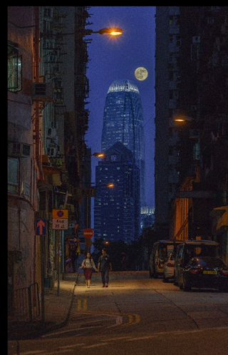
1st Runner-Up: Under a Street Lamp named Desire (Yiu Chi Wing Charles)