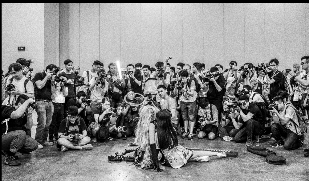
Winner: Photographers (Yip Ka Ming)