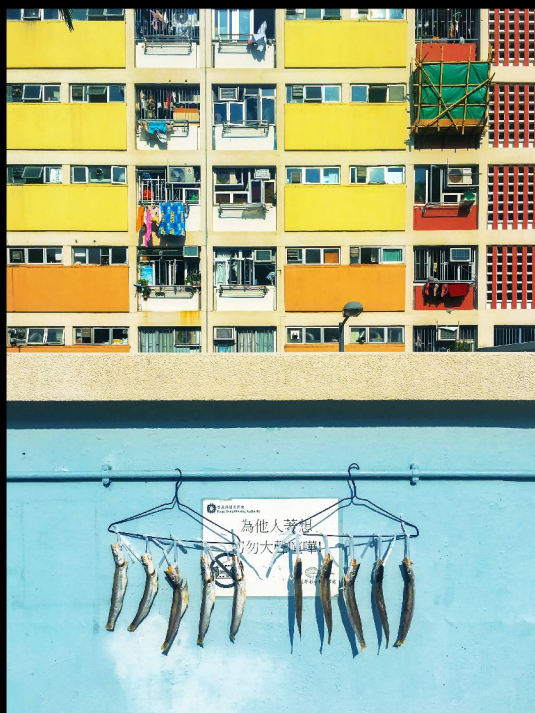
Winner: Fish of Preservation (Wong Kai Lok)