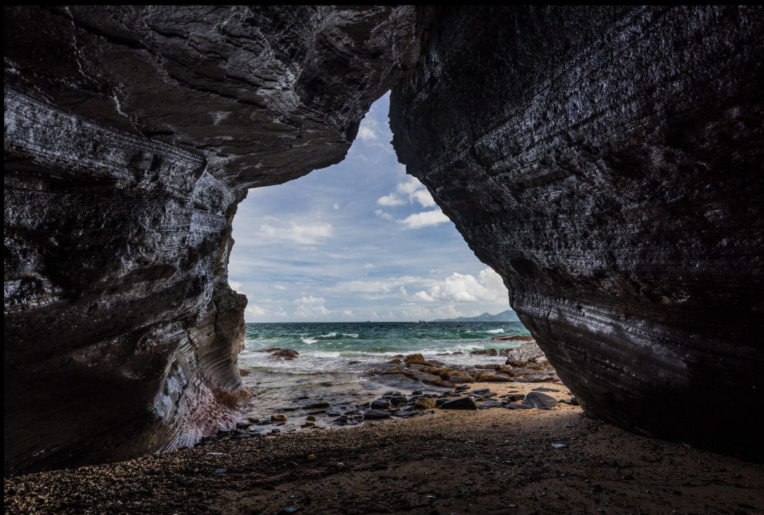
Winner: Exceptional Charm (Tai Ho Yan)